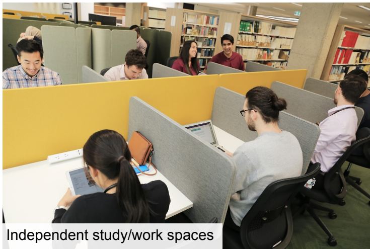
Independent study/work spaces

The Westmead precinct will enable an environment that links healthcare, research and education to empower clinicians, students, patients and carers to be part of world-class, quality healthcare.